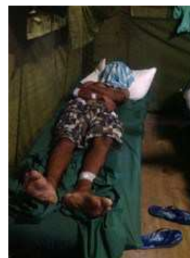
Inside Manus Island Detention Centre, flickr photo (CC BY-NC-ND 2.0)

Australia's harsh policies regarding asylums seekers and refugees are in contradiction with its international human rights obligations, specifically when it comes to its policy of third country-processing, a policy by which asylum seekers are processed offshore rather than in Australian territory. Several UN Human Rights bodies have expressed their concern following the allegation of human rights violations at the Manus Island detention center, including the death of an asylum seeker following violent unrest, and the death of an asylum seeker who did not get medical care in time. FI has teamed up with partners Edmund Rice International and Destination Justice to host a debate at the UN during the Council. One of the panelists will be a key witness on the impact of Australian policy on asylum seekers currently detained on Manus Island and on Christmas Island, allowing the grassroots voice to feature at the Human Rights Council. A statement is being prepared and will be read, denouncing the harsh Australian policy on asylum seekers.