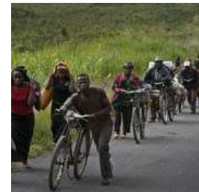
Families on the move to escape the current fighting, eastern DRC.

One of FI's guests will be His Excellency Monseigneur Fridolin Ambongo Besungu, president of the Commission on Natural Resources, a technical commission whose role is to provide the Bishops' Conference with necessary information for advocacy towards a responsible management of natural resources that is beneficial to the Congolese people and to the environment. He will focus his presentation on the impact of mining on the human rights of local communities, to reinforce FI's message that the illegal exploitation and trade of natural resources is one of the root causes fuelling conflict and human rights violations in Eastern DRC.