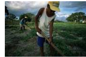
A young boys works with his family tending potatoes.