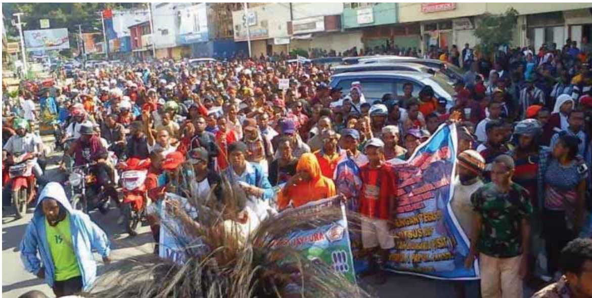
Image 2.1a-1: UNCEN demonstration against Otsus Plus, 7 November 2013.