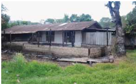
Image 2.6-3: The house of family Bonai was burned to the ground by a group of Muslims