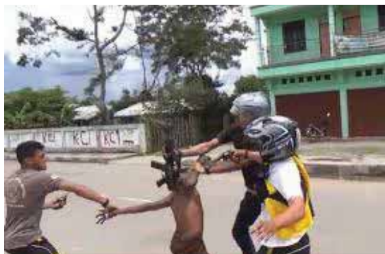
Image 2.5-4: Screenshot of the maltreatment recorded on video in Wamena in November 2013.

On 26 January, joint security forces carried out sweeps in the villages of Dondowaga, Kulirik, Dolugowa, Yambidugun, Kalome, Yalinggua and Talilome in the regency of Puncak Jaya. The