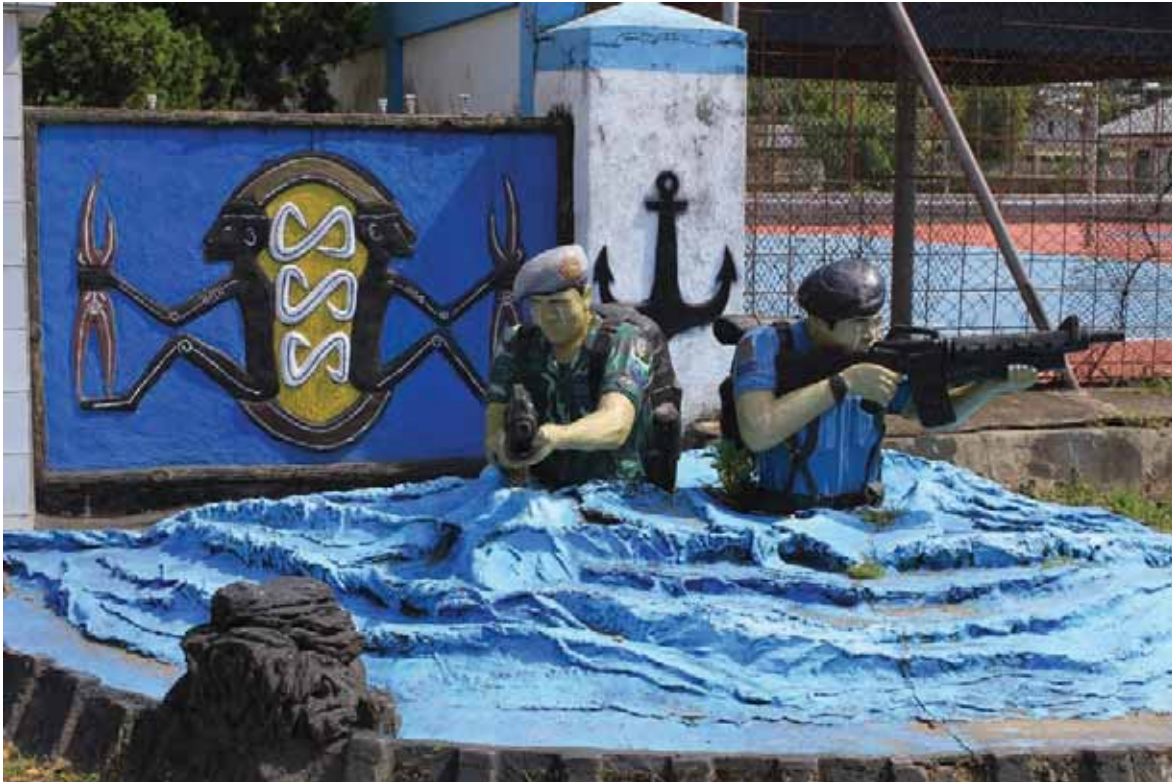
Image 6-1.1 Monument in Sorong symbolizing military power.