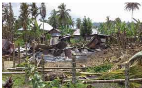
Images 2.6-5: Two of 18 houses that were burnt down by a group of migrants as an act of revenge for the killing of a Javanese Woman named Catur Yuda.