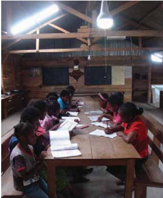
Image 3.2-1: The highlands children studied with very limited facilities to study.