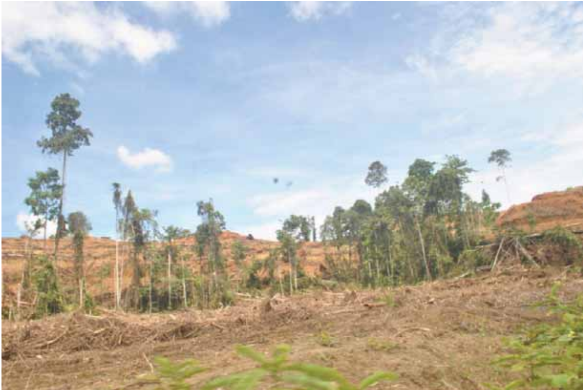
Image 3.3-1: Bulldozers destroy the Yerisiam people's sacred lands around Wami and Sima villages. Thousands of hectares of forest and hilly ground are being destroyed for oil plantations by PT Nabire Baru in Wami and Sima villages, Yaur District Nabire, West Papua.

Although the request for consultation and compensation has been made to the companies responsible, no villagers have received money for medical expenses, education, housing or economic initiatives. In the villages, people experience severe restrictions in their freedom of expression, as the companies limit movement and criticism and reportedly pay silence money to ensure that members of the tribe would not speak out.